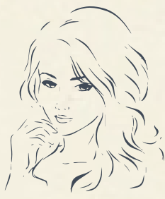
THE SYDNEY THE NOT SO CURLY NOT SO STRAIGHT LOOK. SMOOTH,BOUNCY,VOLUMOUS WITH A FLIRTY KICK