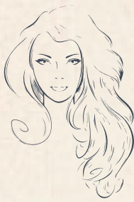
THE PARIS PERFECTLY POLISHED CURLS WITH AN IMMACULATE FINISH