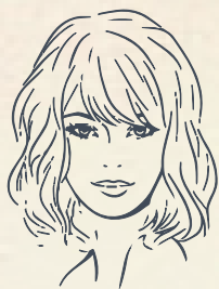
THE MANHATTAN THE MID LENGTHY STYLE WITH NATURAL MOVEMENT AND VOLUME FOR THE EFFORTLESS CHIC