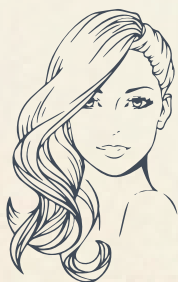
THE HOLLYWOOD IF YOUR FEELING THE OLD HOLLYWOOD GLAM AND DARE THE SMOOTH ULTRA SHINEY WAVES