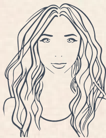
THE CALIFORNIA A CAREFREE PILLOWTALK LOOK. A TOUSLED AND LOOSE BEACH WAVE