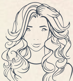
THE MILAN BIG BOUNCY AND SUPER GLAM FOR THE WOMAN WHO WANTS TO BE NOTICED