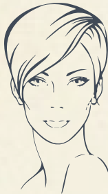
THE ZURICH THE SHORT TEXTURED VOLUME BLOWOUT FOR THE STRONG BUSINESS WOMAN WHO OOZES CLASS AND SOPHISTICATION